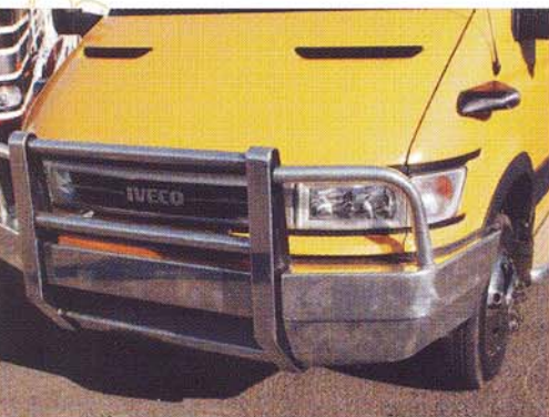
Top: The Iveco and KOR passed braking tests with flying colours. Middle: A fifth wheel hitch has been fitted to the alloy rear tray. Above: A bullbar is an addition from Australian Motor Homes.

of 2750kg. The KOR has a Tare weight of 4100kg and say 700kg of load, so that gives us 4800kg. Adding both the loaded weight of Iveco tow vehicle (2750kg) and KOR fifth wheeler (4800kg) gives us a total of 7550kg – well within the Iveco GCM of 8500kg.